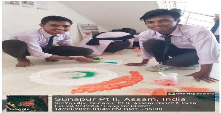
Decorating College walls & Boards with Tiranga-inspired art.